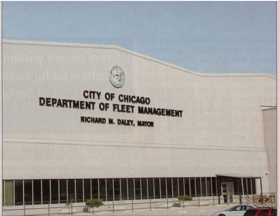
City of Chicago, Department of Fleet Management takes top honors. The fleet was named number one fleet in the country based on the 100 Top Fleet criteria.

Congratulations to some of our industry's most accomplished achievers. FE